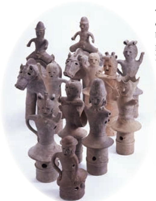
Haniwa (clay tomb figures) excavated at Yatano Ejiri Kofun