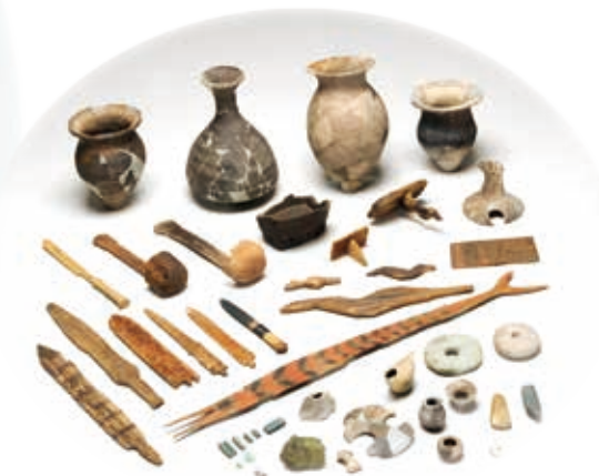
Artifacts excavated at Youkaichi Jikata Ruin