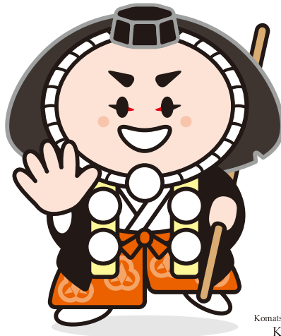
Komatsu Mascot Character KABUKKI