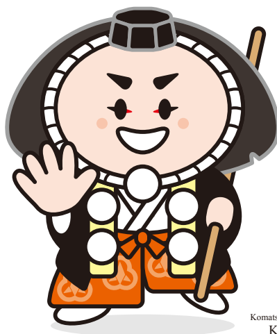
Komatsu Mascot Character KABUKKI